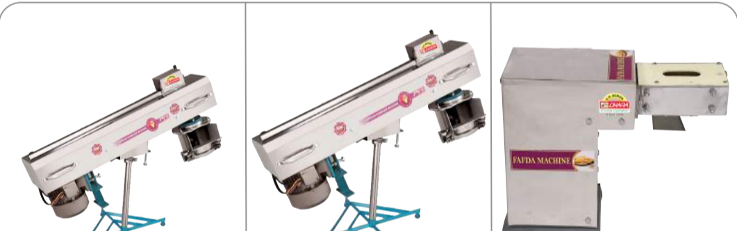
MIXING 5 K.G.