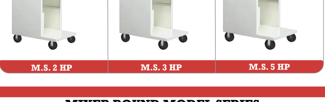
STEEL 2 HP