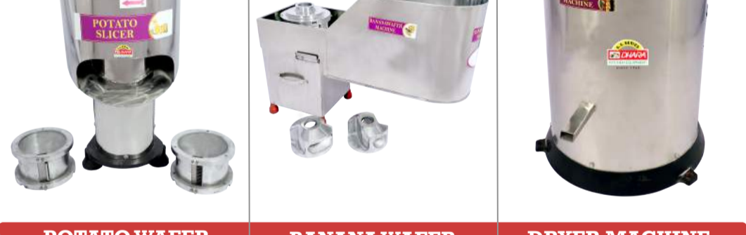
MIXING 20 K.G.