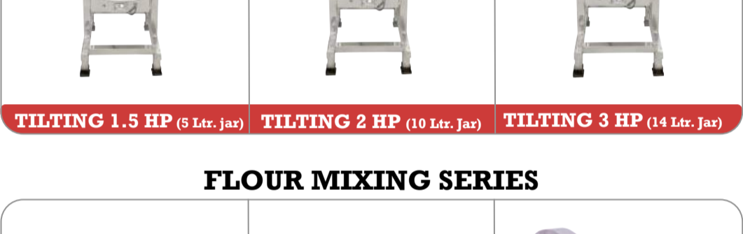
M.S. 2 HP