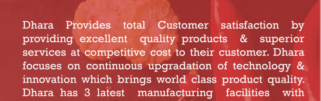
DP - 01