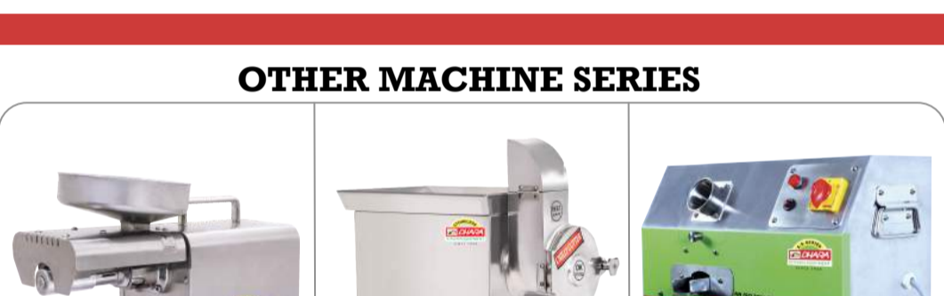
TILTING 1.5 HP (5 Ltr. Jar)