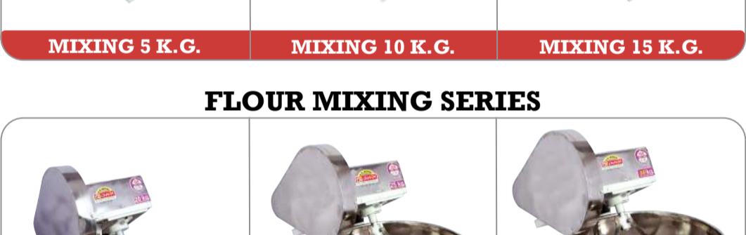
MIXER 0.5 HP